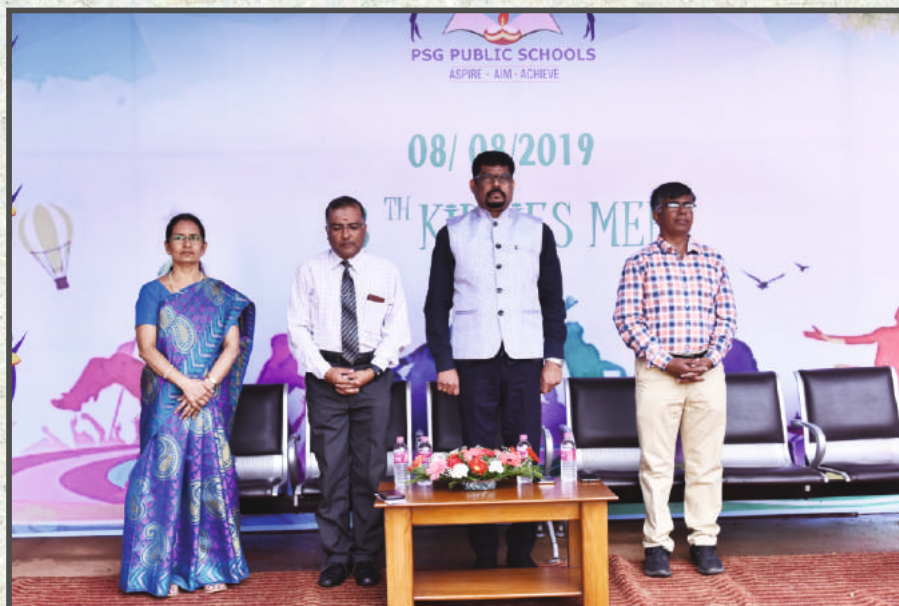
Kiddies Meet - 2019