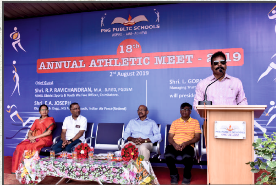
Annual Athletic Meet - 2019